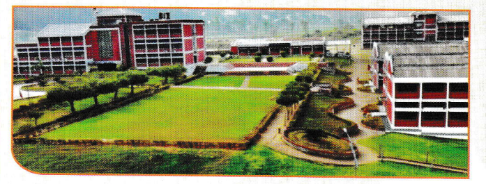
Bhagwant Institute of Technology, Mzn. (U.P.)

Baxil Garhwal University, Narendra Nagar (U.K)