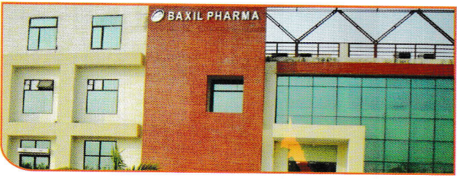
Baxil Pharma, Haridwar (U.K.)